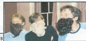
putting a brave face on the rehearsals for Love's Labour's Lost